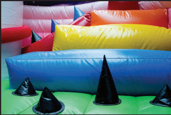
Tiz Creel, Space for autonomous imagination , 2019, Courtesy the artist