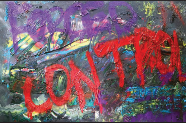
George Boros, CONTROL, 2019