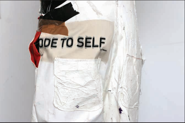
Tyreis Holder, Ode to Self, 2018